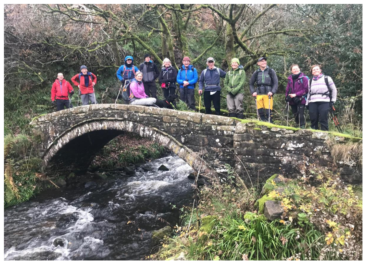
The team on the Hollinsclough walk on 2 November.