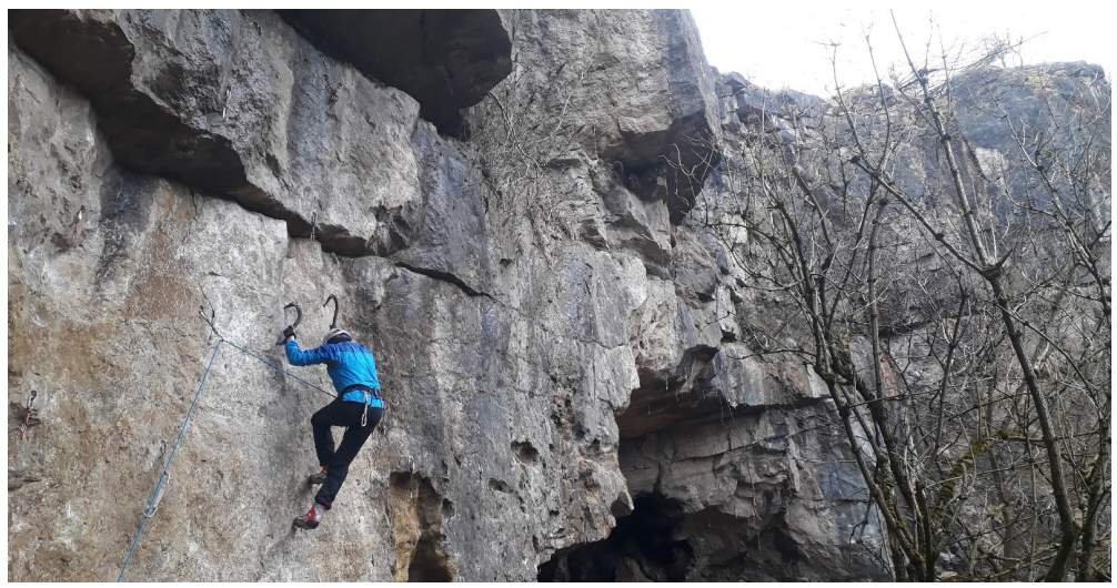
The "warm up" at Masson Lees always provided a spicy intro to this niche activity – easier options are now available.

The routes are well bolted with many of the quickdraws in place, which makes leading, clipping, stripping and failing very easy. If you have a sport climbing belay device for single rope then bring it along.